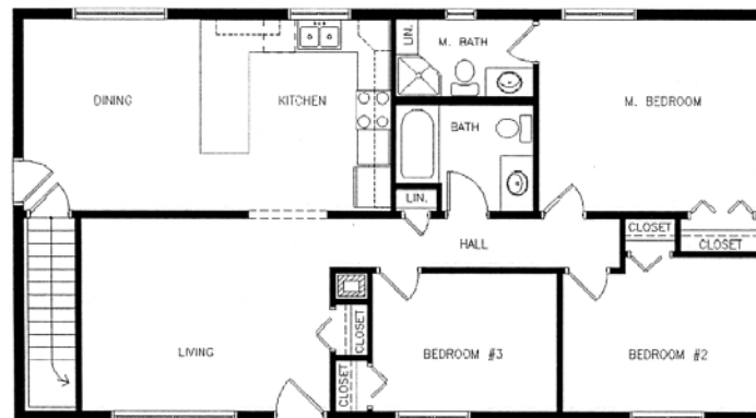
SAMPLE FLOOR PLAN